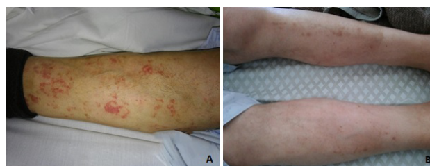
Figure 1. A) Annular and non palpable purpuric and violaceous rash on extensor face on the lower limbs at hospital admission and B) After a few days of antihistaminic therapy with resolution of cutaneous lesions with residual mild hyperpigmentation. The patient gave permission to reproduce his photos, although he could not be identifiable.

In March 2017, an 82-year-old Caucasian male was admitted to the Internal Medicine Department with a 4-week history of painless, urticariform rash on the lower limbs and back, with no association with exercise, stress, food, temperature, alcohol intake or contact. Additionally, he described intermittent bilateral asymmetric and inflammatory medium joint polyarthralgia, thoracic pain, fatigue, unintentional weight loss, and nocturnal sweating. Antihistaminic and prednisolone 0.25 mg/Kg/day have been prescribed without resolution. His medical records disclosed moderate thrombocytopenia, heart failure, gout, dyslipidemia and arterial hypertension. He was chronically medicated with a statin, digoxin, diuretic, aspirin, angiotensin-converting enzyme (ACE) inhibitors, calcium channel blockers, allopurinol and nonsteroidal anti-inflammatory drug (NSAID), with no previous known allergies. He was a farmer, without animal contacts. His family history was unremarkable. Physical examination revealed annular, non-palpable purpuric rash on the extensor face on the lower limbs (figure-1A) and confluent urticariform lesions on the back with neither palmoplantar involvement nor angioedema. He was febrile (maximum 39.3°C) at least once a day during the first week of hospitalization. There were no ocular symptoms, oral or genital ulcers, malar rash, photosensitivity, or discoid lesions. He had no signs of arthritis, thyroid nodules or palpable lymph nodes. Neurological exam was normal.